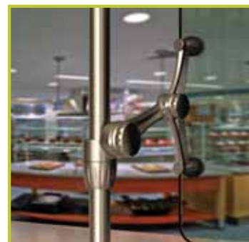
Full-Serve Almost Fully Extended