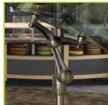
Self-Serve Retracted Position