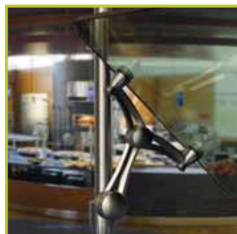
Self-Serve Partially Extended